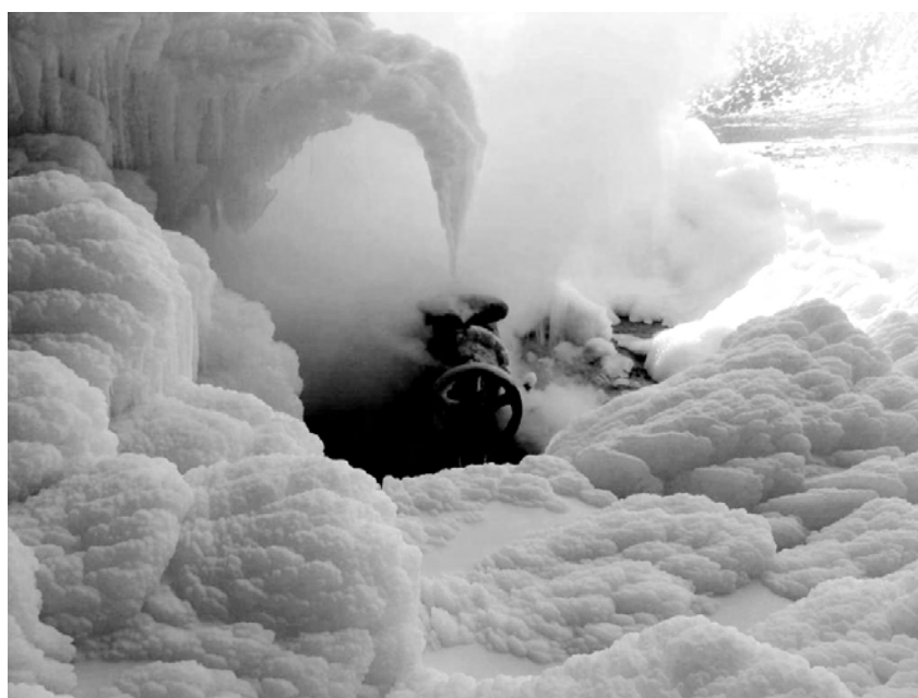
An exploration well in Yangyi geothermal field, Tibet, China

Exploration of another geothermal field, Yangyi, was completed in 1990. It is located 72 km west of Lhasa and 55 km south of Yangbajain. The field covers an area of 10.8 km 2 . The reservoir is in fractured volcanic rocks. Exploration wells reached a depth of 1,000 m. The wellhead working temperature is 105-190°C with most wells reaching 170-190°C and the highest 201.67°C. Geothermal resource assessment showed a potential generating capacity of 18 MW for the existing wells. The whole geothermal field has a potential of 30 MW. Compared with Yangbajain geothermal field, the Yangyi geothermal field has some advantages: high temperature, high pressure, no scaling and high yield from a single well.